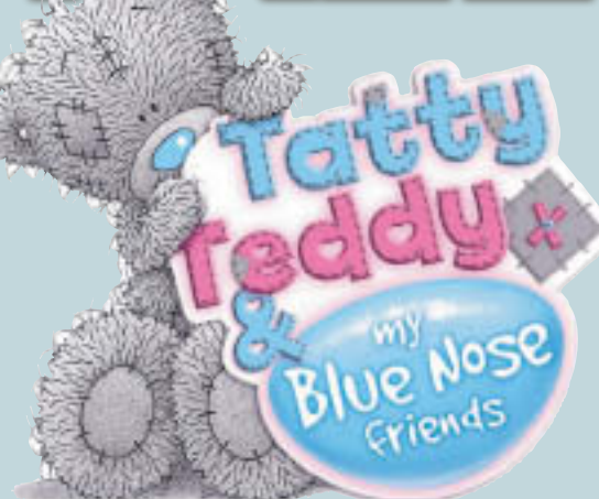
FIGURE AT TOYS R US

TO celebrate the launch of the Tatty Teddy & My Blue Nose Friends app, we've teamed up with Toys 'R' Us to give your little ones a Blue Nose Friends collectable figure for free.