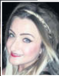
EDGE OF GLORY: Grace sings

Grace said: "It is a good lifestyle but it's a lot harder than people give singers credit for."