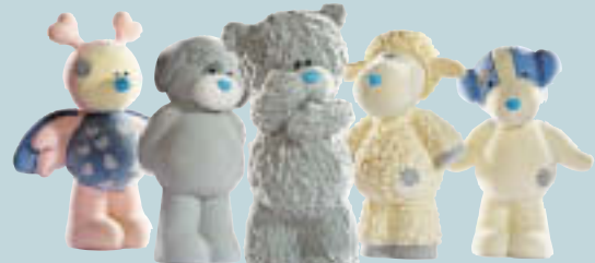
Styles and sizes may vary

To see the entire range of Tatty Teddy & My Blue Nose Friends toys and to find out about the app, visit tattyteddytoys.com . So what are you waiting for? Claim your freebie today!