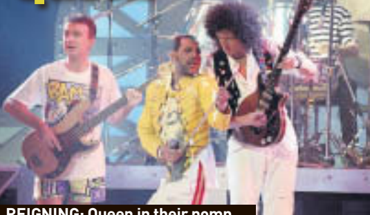
REIGNING: Queen in their pomp