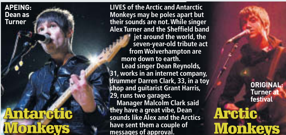
ORIGINAL: Turner at festival